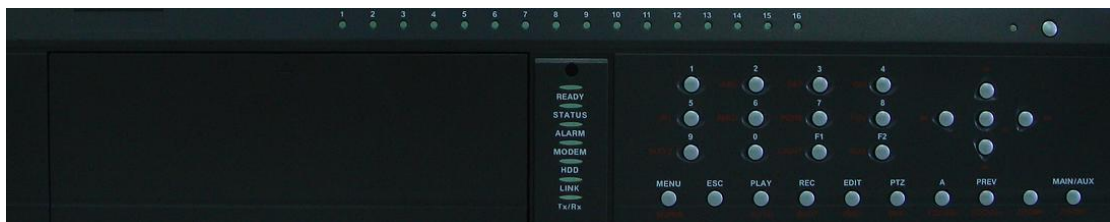
DS-8000HTI-S Front Panel

DS-8000HTI-S series combines the advantages of Digital Video Recorder (DVR) and Digital Video Server (DVS). It is widely applied as a stand-alone unit or a part of a powerful surveillance system.